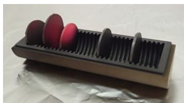
Fig. 1. Photograph of the oxidation reaction of uranium carbide disks in the graphite container. Diameter and thickness of a disk are 18 mm and 0.8 mm, respectively. The amount of uranium in a disk is about 0.7 g.

A glove box was installed in the draft chamber at the working area to handle uranium carbide targets safely. Figure 2(a) shows the setup with the glove box. Since this glove box has the capacity of vacuum gas replacement, the oxygen concentration becomes less than 0.001% vacuum gas replacement with nitrogen gas (less